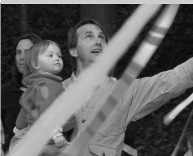
Beltane Community Forest Festival 2006

Printed on Mondanock Astrolite PC100, an FSC-certified, 100% post-consumer waste recycled paper, processed chlorine-free.