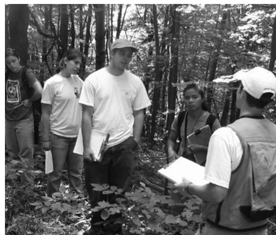
UVM Students at Little Hogback Community Forest.