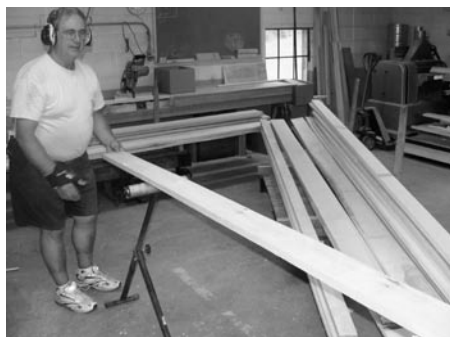
Milling Family Forest® flooring at North Station Millworks in North Ferrisburgh.

The energy crunch is heating up. Heating oil at this writing is now over $4.00 per gallon and gasoline is well over $3.75 per gallon. Split, green, delivered wood is now $220.00 per cord if you can find it. Two local sawmills have moved from into wood fuels in a very big way. A wood pellet plant is currently being considered for Addison County. At the same time, global wood biomass shipments are expected to be well above the record of 11 million tons reached in 2007, this up from just 5.6 million tons in 2003. Three million tons of that