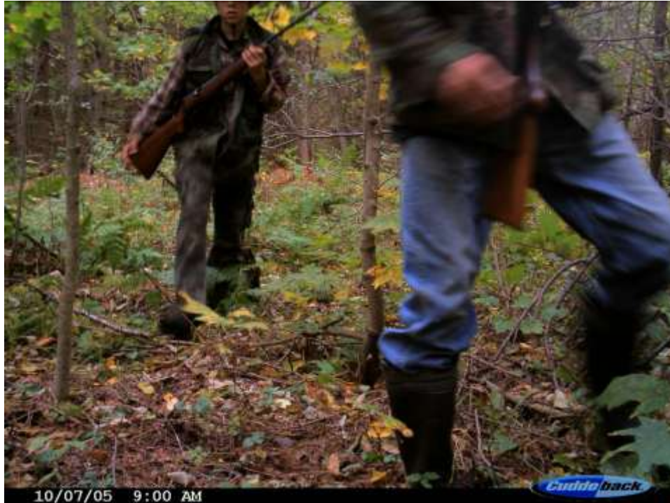
Fig. 16 Hunters Date: 7 October 2005 Location Code: 05CD02 GPS: 44°09'04.4"N, 73°01'12.1"W Habitat: ES14 near lower junk car (This was the first picture taken with the new digital camera.)