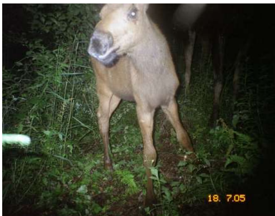
Fig. 2. Alces alces (Moose Calf) Date: 18 July 2005. Same location code. Notice legs of adult animal in background in both pictures.