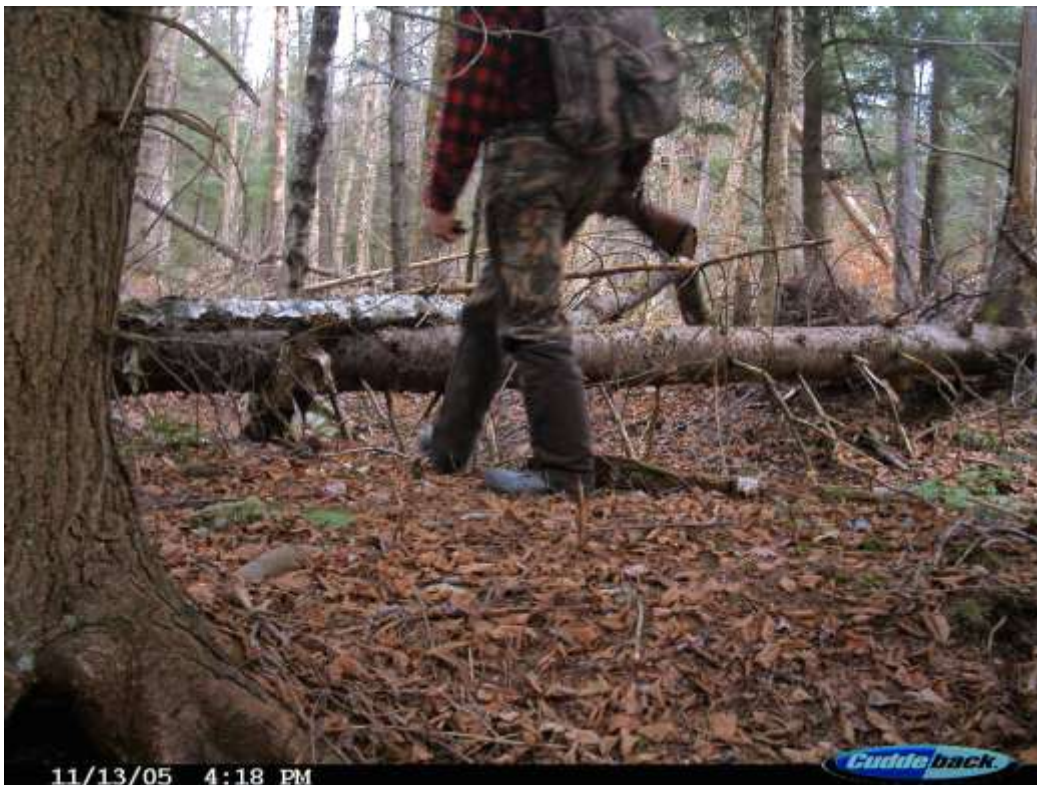
Fig. 17 Hunter (same location as Whitetail deer in Fig. 5) Date: 13 Nov 2005 Location Code: 05CD03 GPS: 44°08'55.5"N, 73°01'07.8"W Habitat: ES14