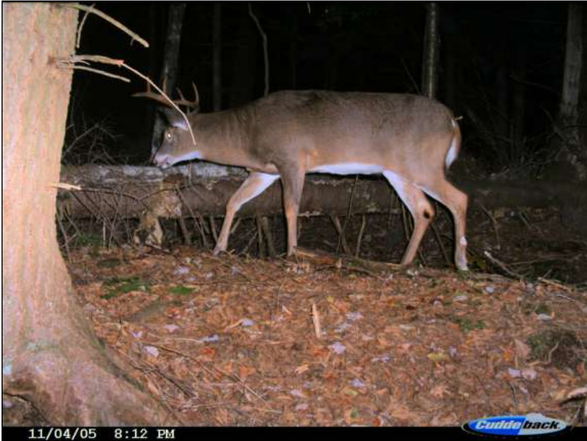
Fig. 5 Odocoileus virginianus (Whitetail Buck) retreating. Date: 5 Nov 2005 Location Code: 05CD03 GPS: 44°08'55.5"N, 73°01'07.8"W Habitat: ES14