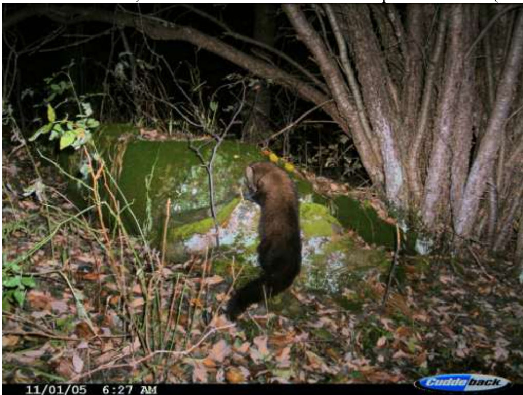
Fig. 10 Martes pennanti (Fisher) Date: 1 November 2005 Location Code: 05CA04 GPS: 44°09'02.8"N, 73°00'07.7"W Habitat: Rock outcrop near old fields (ES14/22)