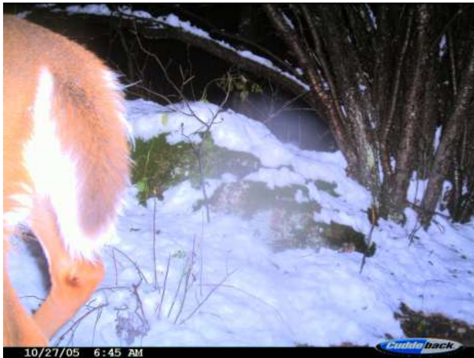
Fig. 6 Odocoileus virginianus (Whitetail Deer tail) Date: 27 October 2005 Location Code: 05CA04 GPS: 44°09'02.8"N, 73°00'07.7"W Habitat: Rock outcrop near old fields (ES14/22) First heavy and wet snowfall.