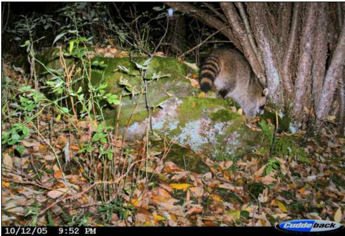
Fig. 14 Procyon lotor (Raccoon) Date: 12 October 2005 Location Code: 05CA04 GPS: 44°09'02.8"N, 73°00'07.7"W Habitat: Rock outcrop near old fields (ES14/22)