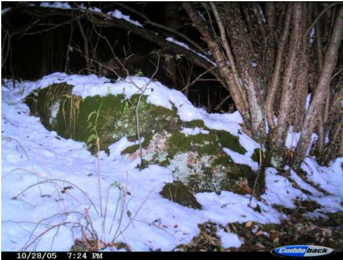
Fig. 9 Martes pennanti (Fisher; on top of rock) Date: 28 October 2005 Location Code: 05CA04 GPS: 44°09'02.8"N, 73°00'07.7"W Habitat: Rock outcrop near old fields (ES14/22)