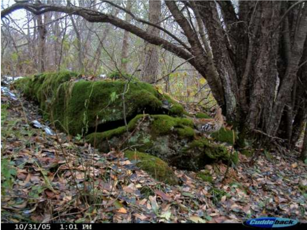
Fig. 15 Bonasus umbellus (female Ruffed Grouse) Date: 31 October 2005 Location Code: 05CA04 GPS: 44°09'02.8"N, 73°00'07.7"W Habitat: Rock outcrop near old fields (ES14/22)