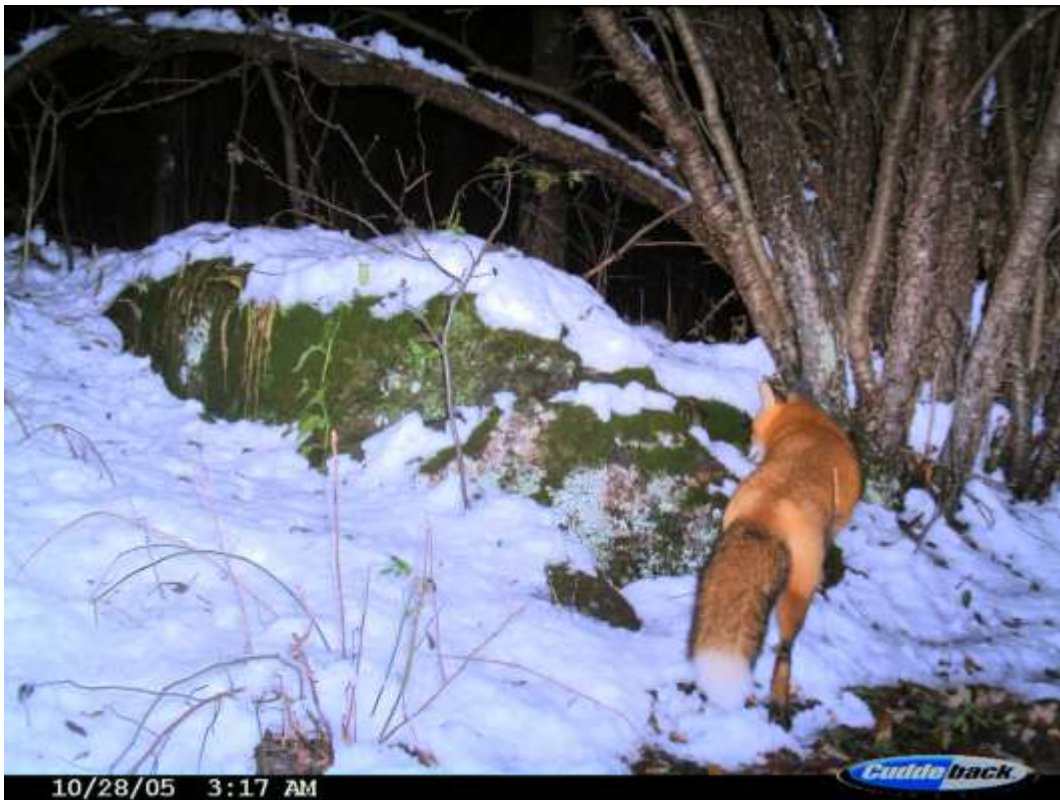
Fig. 13 Vulpes vulpes (Red Fox) Date: 28 October 2005 Location Code: 05CA04 GPS: 44°09'02.8"N, 73°00'07.7"W Habitat: Rock outcrop near old fields (ES14/22)