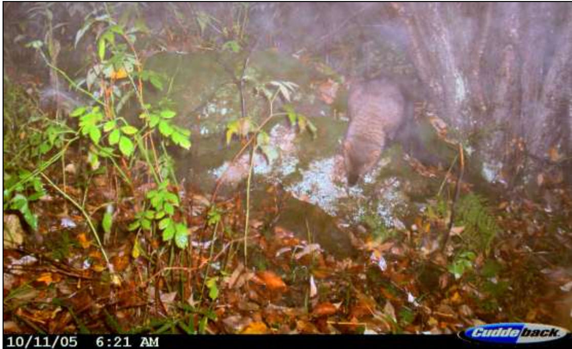
Fig. 7 Martes pennanti (Fisher) Date: 11 October 2005 Location Code: 05CA04 GPS: 44°09'02.8"N, 73°00'07.7"W Habitat: Rock outcrop near old fields (ES14/22)