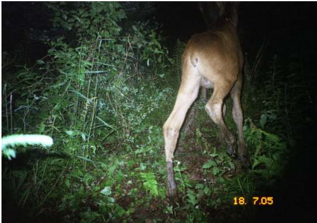
Fig. 4. Alces alces (Moose Calf) retreating. Date: 18 July 2005; same Location