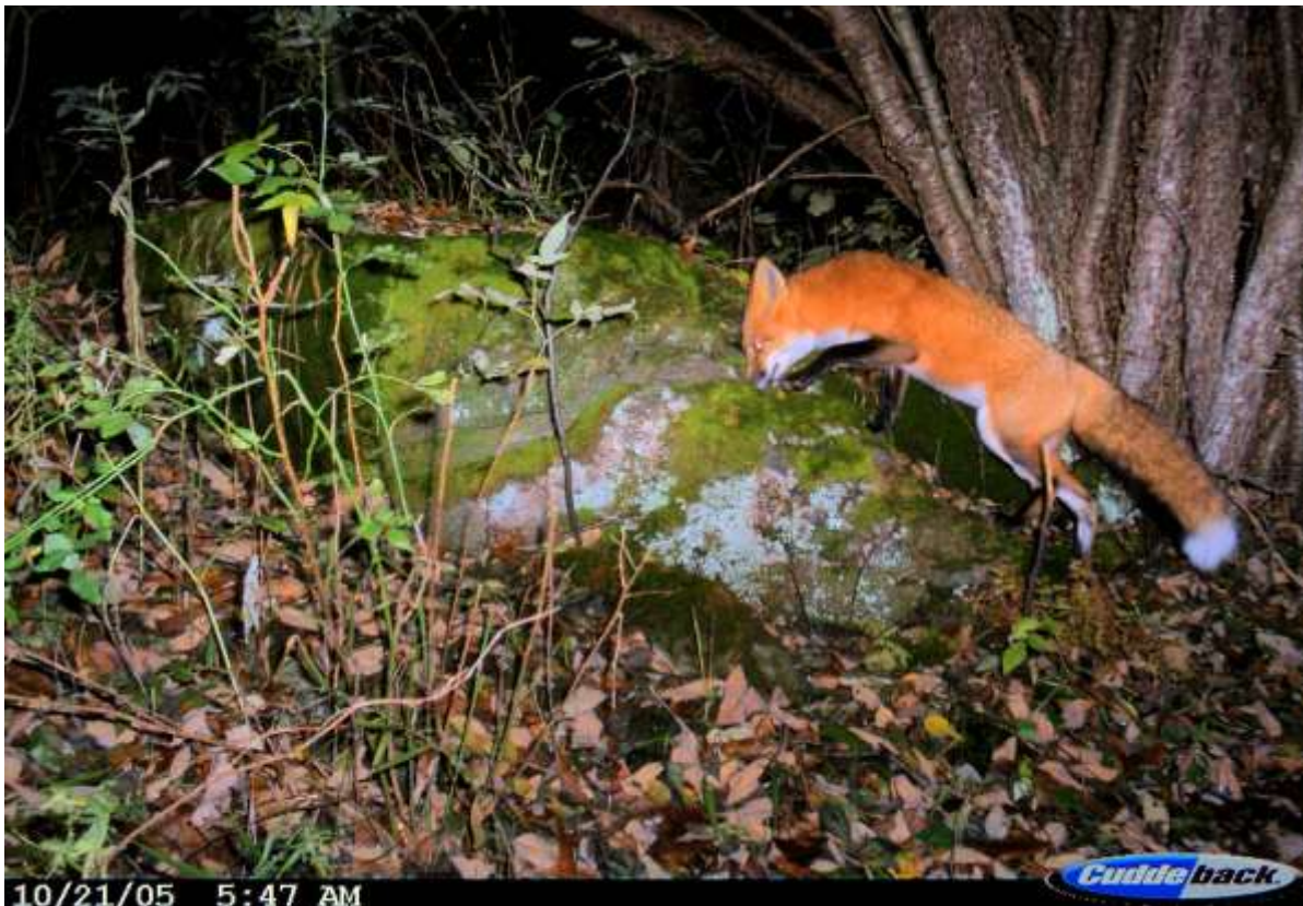
Fig. 11 Vulpes vulpes (Red Fox) Date: 21 October 2005 Location Code: 05CA04 GPS: 44°09'02.8"N, 73°00'07.7"W Habitat: Rock outcrop near old fields (ES14/22)