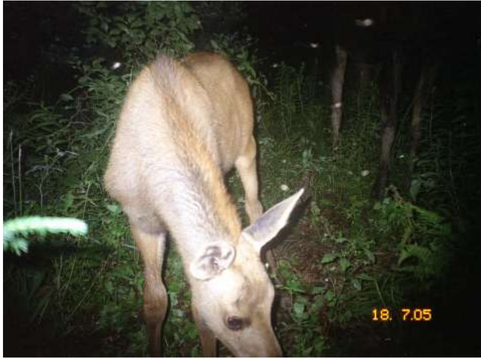
Fig. 3. Alces alces (Moose Calf) Date: 18 July 2005; same Location.