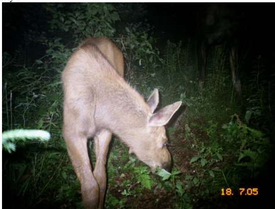
Fig. 1. Alces alces (Moose calf) Date: 18 July 2005 Location Code: 05CA01 GPS: 44°09'08.0"N, 73°01'28.8"W Habitat: Edge of Beaver Pond, ES 20