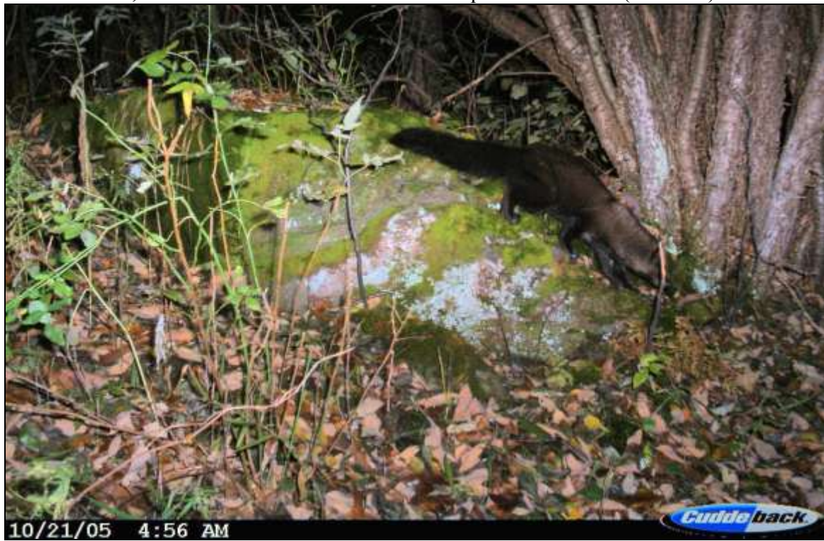
Fig. 8 Martes pennanti (Fisher) Date: 21 October 2005 Location Code: 05CA04 GPS: 44°09'02.8"N, 73°00'07.7"W Habitat: Rock outcrop near old fields (ES14/22)